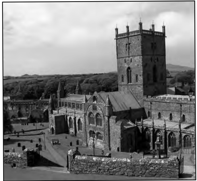
St. David's Cathedral in the city of St. David's in Pembrokeshire, Wales.

Visit us on the web: www.stdavidsofmn.org